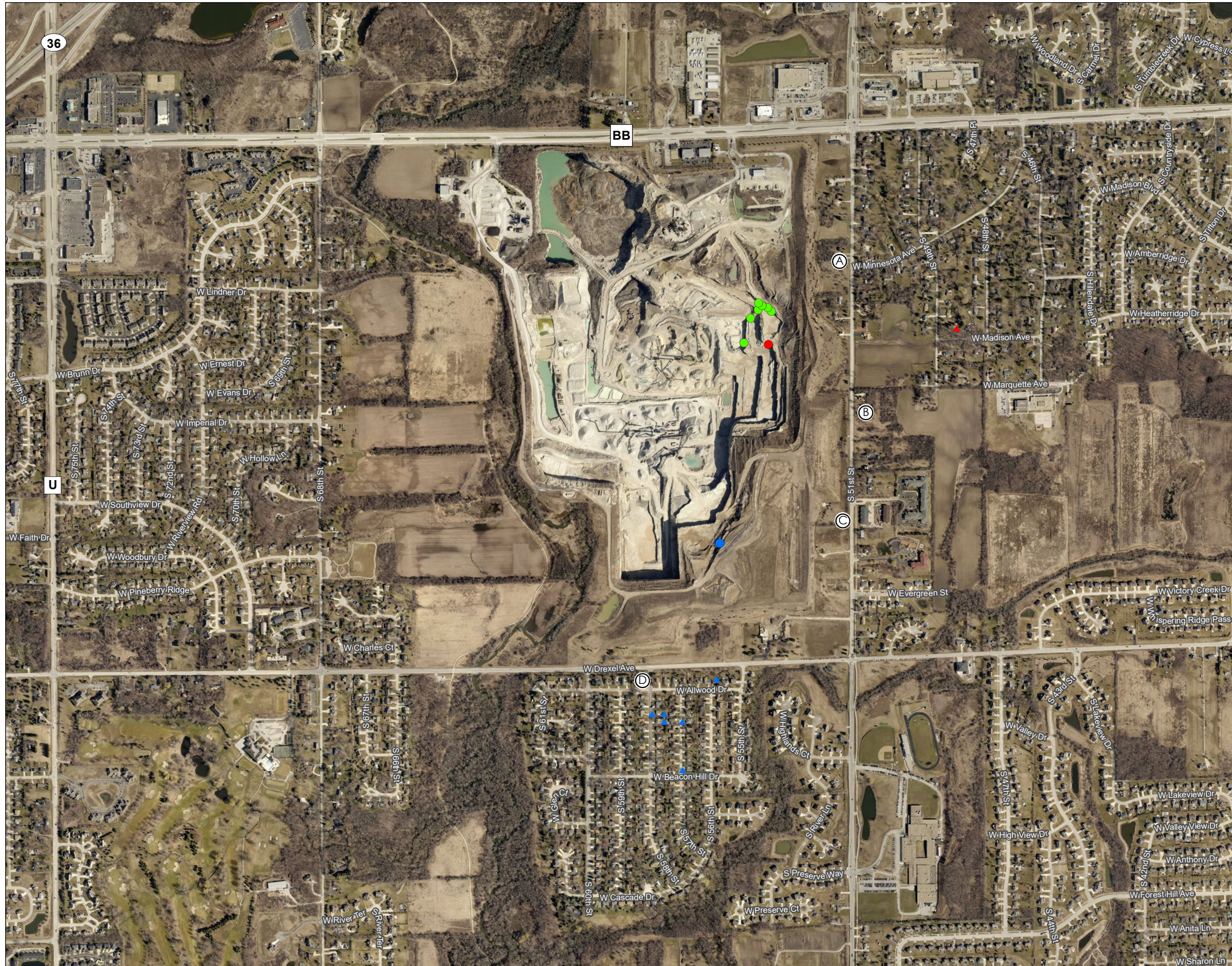
Figure No. 1 Seismic Monitoring, Blasting, and Complaint Locations - 1st Quarter 2021

Client/Project: City of Franklin, Vicinity of Payne and Dolan Quarry 193707487